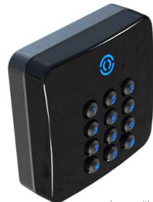
(spacer with RX1K fitted)