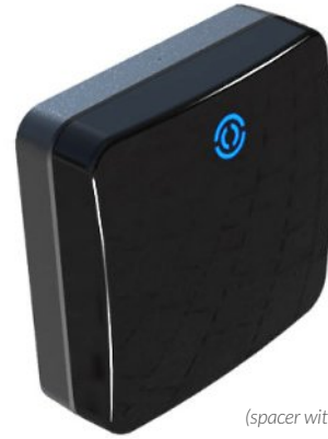
(spacer with RX1 fitted)

Reader Models are sold as customer-specific configurations.