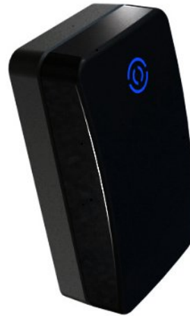
(spacer with RX4 fitted)

Reader Models are sold as customer-specific configurations.